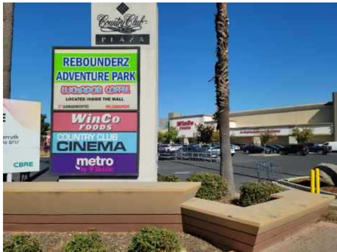
Country Club Plaza