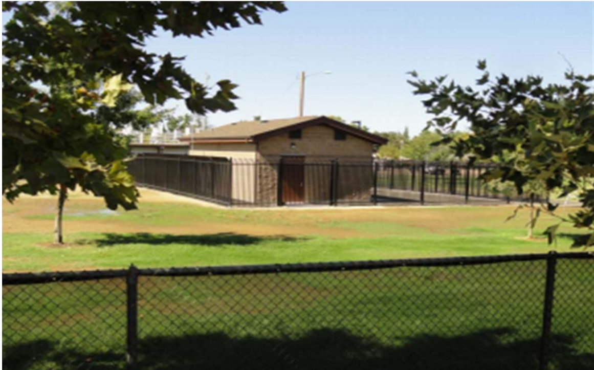
Del Paso Manor Water District Well #9, Constructed in 2010